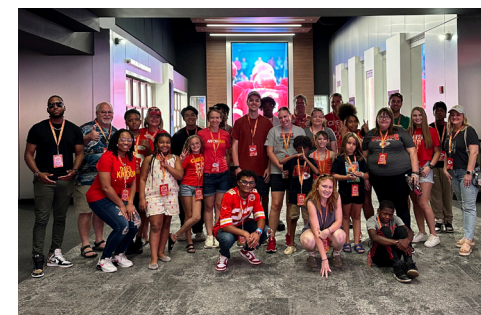
Private Tour of Arrowhead Stadium