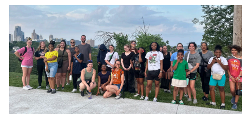
Match Miles Urban Hike