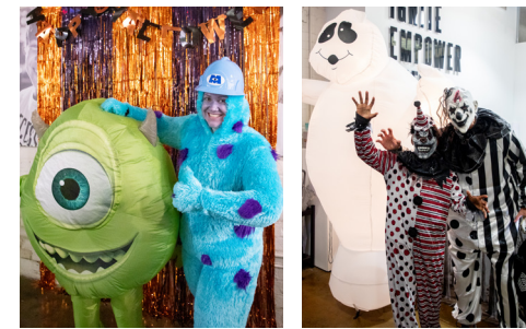
Annual Halloween Party

We work with local companies to provide free activities and food for all of our Matches. Know of a potential partner or want to host an activity yourself? Let us know!