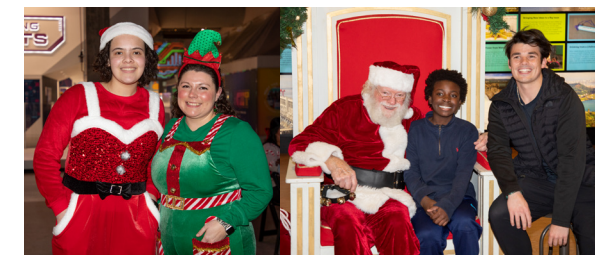
Annual Holiday Party